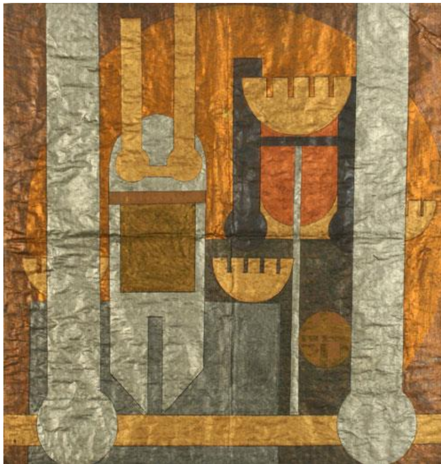
Image 3. Pílar F. (1962). Mosques of Isfahan (c) , Ink, Paint and Printed seals on paper, 34x33 in.