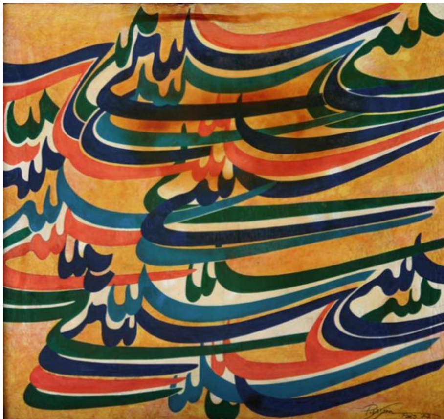
Image 4. Pialaram, F. (1972). Untitled , Ink on canvas, 170x200 cm.