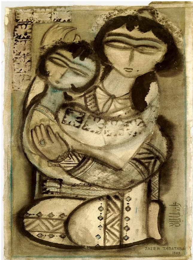
Image 8. Tabatabai, Zh. (1959). Two figures, Oil on stretched canvas, 111/5x65 cm.

Zhazeh Tabatabai (1931-2008) is a hard-working artist whose continued effective presence along four decades of contemporary Iranian painting and sculpture has greatly contributed to the prosperity and wealth of this country's art. He is most known for the assemblage figures and sculptures created from metal parts of cars, fragments of industrial machinery and iron scrap. But in the field of painting, he should also be considered one of the pioneers who, like many other painters who exhibited their works from the early 1930s, sought to combine indigenous/tribal and national elements of Iran with modern techniques. His paintings and sculptures carry symbols and signs present in Iranian mythology, folkloric culture and traditional Persian arts and crafts.