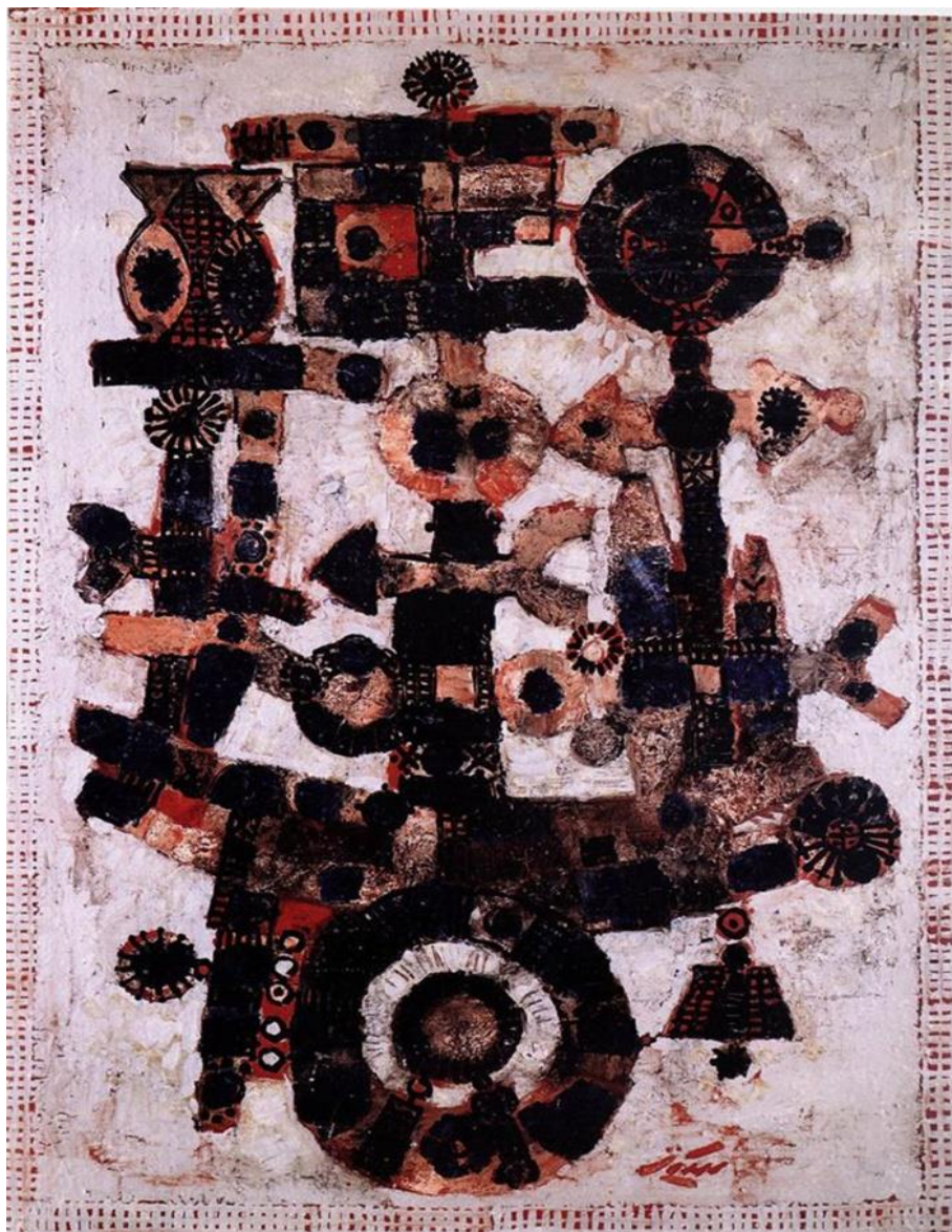
Image 5. Qandriz, M. (1963). Untitled , Oil on canvas, 80x115 cm, Tehran, Museum of contemporary Art.